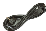
2x IEC cord